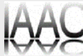
Inter-American Accreditation Cooperation (IAAC)